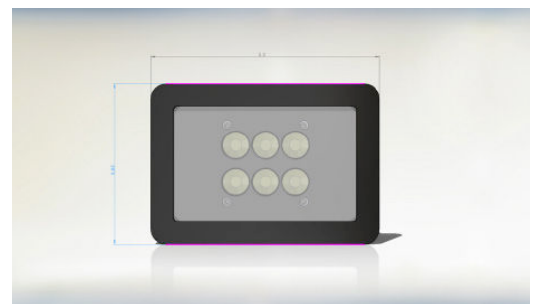
Illuminator Front View