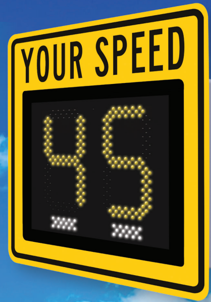
Choice of faceplate colors available

The Traffic Logix® SafePace® 250 driver feedback sign is a compact speed display sign. With slightly larger digits than the entry level SafePace® 100, but still smaller than the full size 15" digits on larger SafePace® signs, the SafePace 250 offers a versatile solution for those looking for a slightly larger sign.