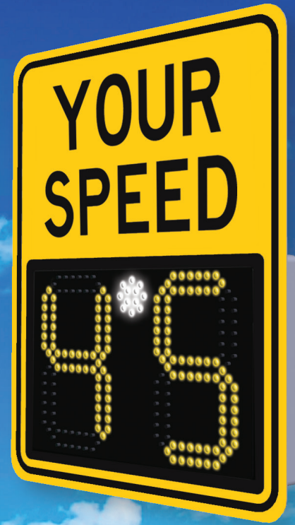
Choice of faceplate colors available

The Traffic Logix® SafePace® 100 driver feedback sign is the solution that fits your budget.